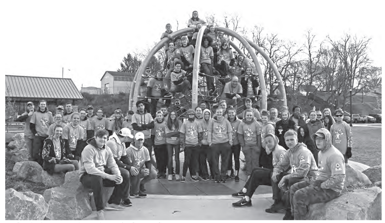
MHS and John Young students volunteer for Comcast Cares Day

John Young Middle School Athletics: Simply text the number 630-608-6843. In the body/message of your text, type: @jymsat you will get immediate response indicating that you are signed up.